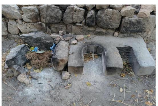
Figure 7: The wood fire oven and tandoor indicate the daily life practices of rural life

In the past, scorpions were rarely seen however as soon as restoration work began, they could be more readily observed. Perhaps this was due to the disturbance of their habitat. When the house repair started, the scorpions began to come out; I guess we changed their places too. A higher number of bees and ants are also present. When water levels were limited, they could become aggressive and attack when we were outdoors on the terrace. (Sibel, 21 y., student).