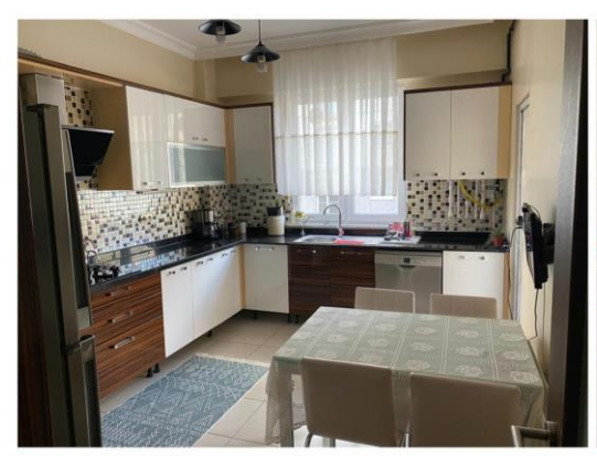
Figure 2: The living room and kitchen of Bahar's home in Yenişehir