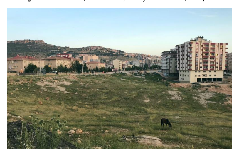
Figure 5: A rurban (rural-urban) view from Mardin, Yenişehir